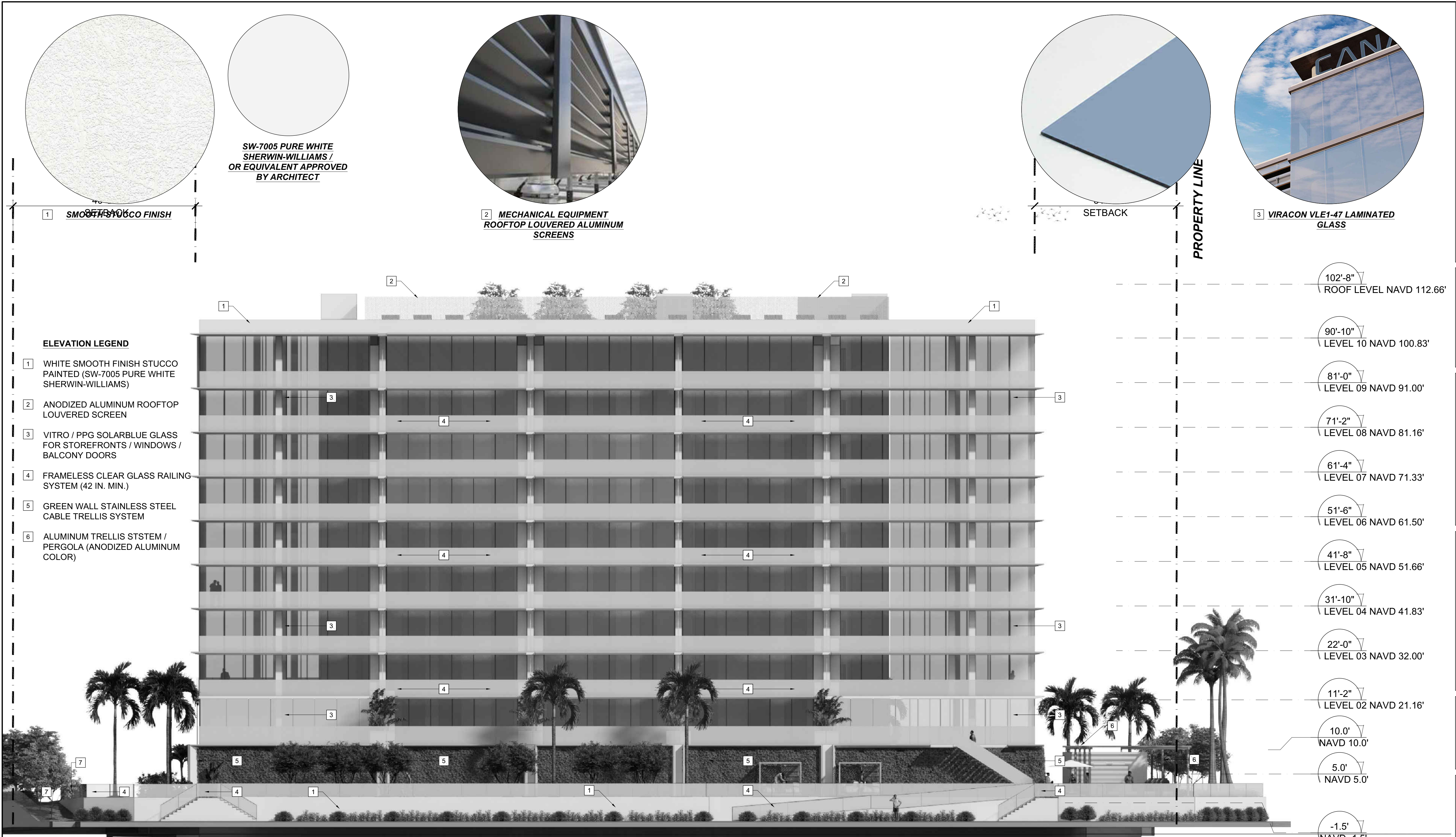
1 REAR ELEVATION (WEST) A-502 SCALE: 3/32" = 1'-0"